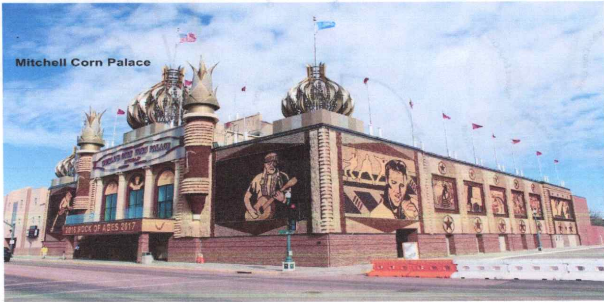
The Mitchell Corn Palace