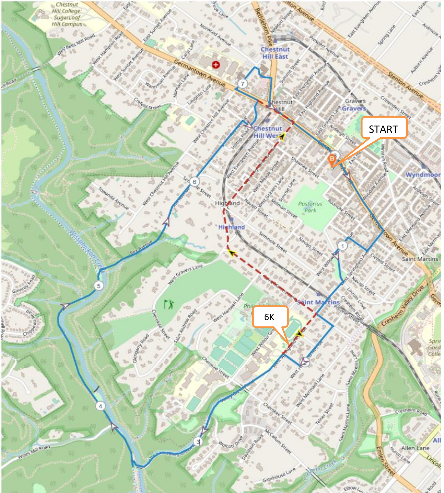
Chestnut Hill Map 8K/6K

troops from the Battle of Germantown marched past this farmhouse in 1777. Later the Liberty Bell passed by on its way to Allentown for storage when the British occupied Philadelphia.