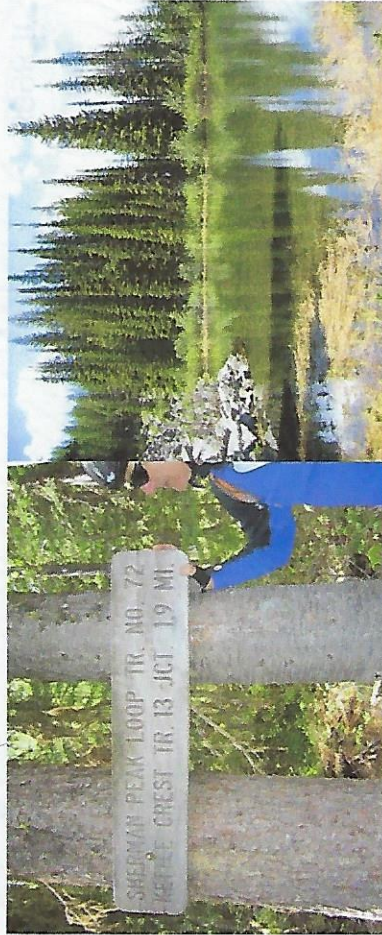
View #1: Junction with #13