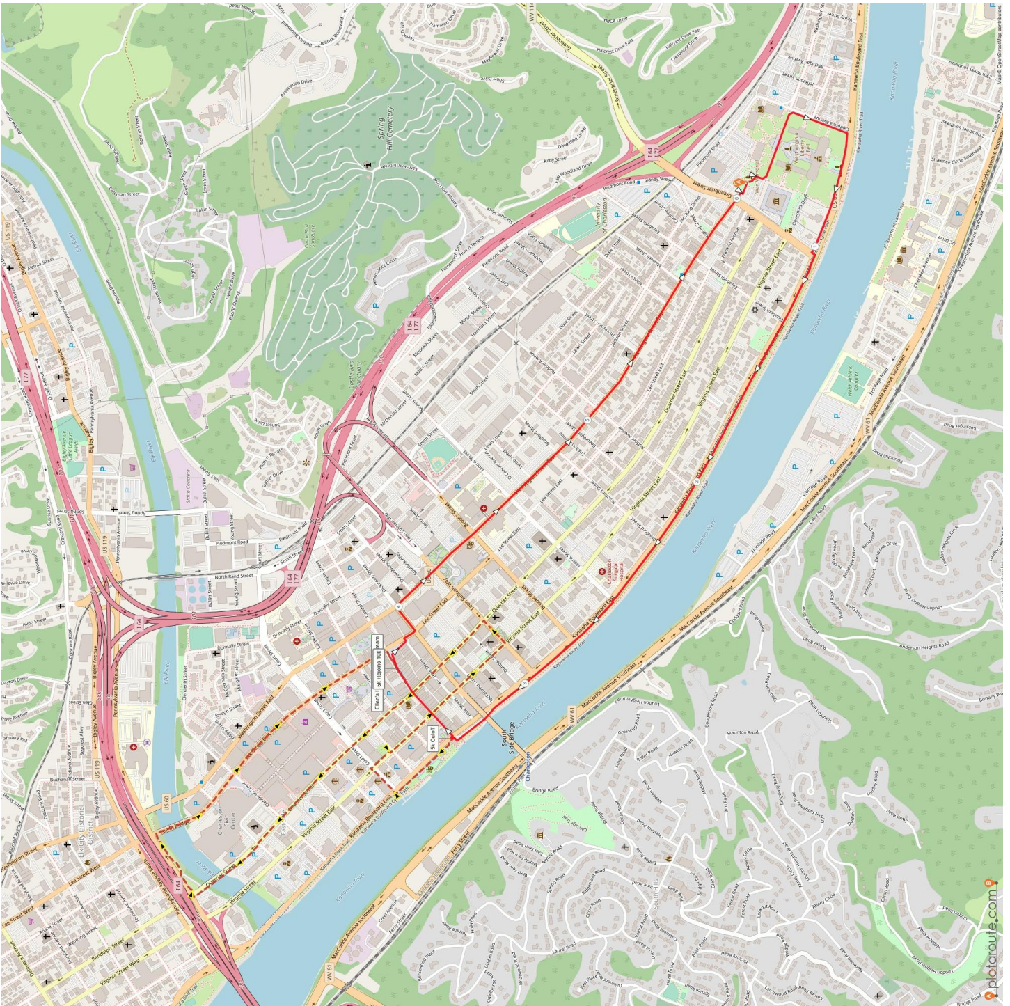
Map created by plotaroute.com, map background copyrighted by OpenStreetMap contributors 5k trail is the solid red line, 10k extension is the dashed red line.