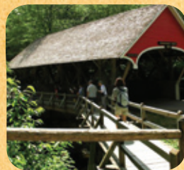
The Flume Covered Bridge