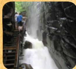
The Flume Gorge