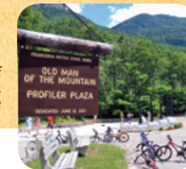
Old Man of the Mountain Historic Site

EXIT 34A The Flume Gorge, Gilman Visitor Center and a two-mile self-guided nature walk are located at this exit. The Flume is a natural gorge with spectacular waterfalls, vistas and covered bridges. The visitor center offers restrooms, a cafeteria, gift shop, historical displays and a free introductory movie about the park.