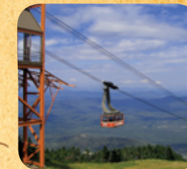
Cannon Mountain Aerial Tramway