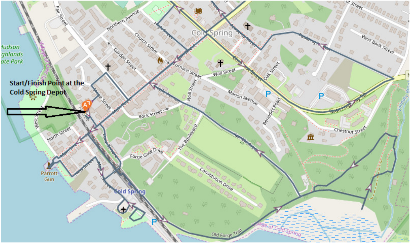
Map A: Lower Portion of 10K Route