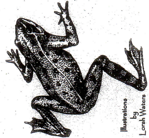
Illustrations by Lorah Waters

The trail is an easy loop hike of 4 miles.