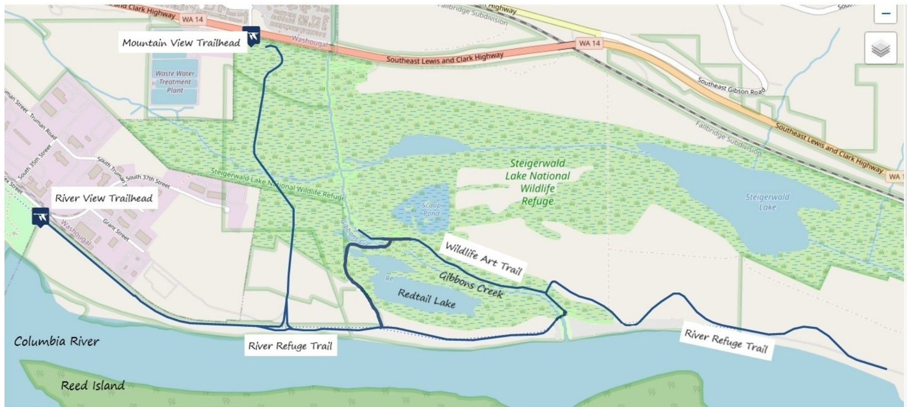
Janet Traweck, 360/833-2429; 360/601-9534 cell; Emergency, 911 Vancouver Walking Club© 2024; Updated 1/2/2024 These directions may be used only by persons duly registered for this AVA/IVV sanctioned event.