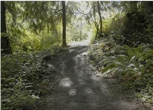
Barrier Falls Trail

Fishing: Steelhead are available to the angler from December through February. For the angler seeking spring Chinook, May to July is the best time at Gnat Creek. The hatchery provides 2-1/2 miles of easy fishing access for spring Chinook and winter steelhead.