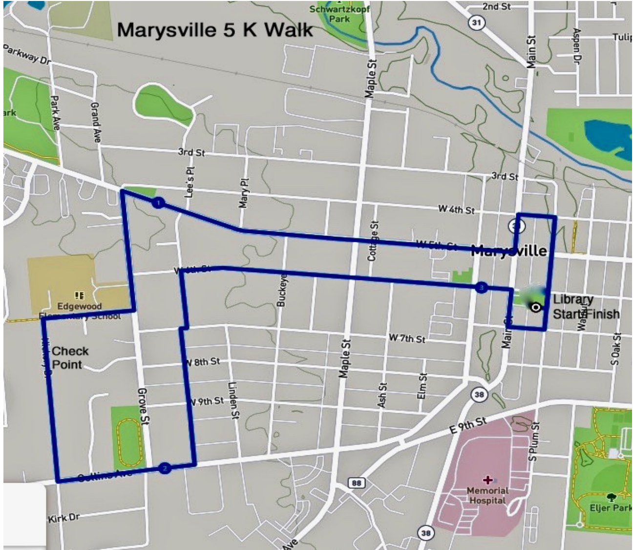
August 2020

The Heart of Ohio Hikers hope you enjoyed this walking tour of Marysville, Ohio