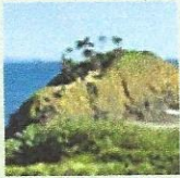
Battle Rock Park

However, in 1850, the US Congress passed the Oregon Donation Land Act. This Act allowed white settlers to file claims on Indian land in Western Oregon although no Indians Nations had signed a single treaty.