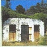
Cool & Unusual Lifeboat Station