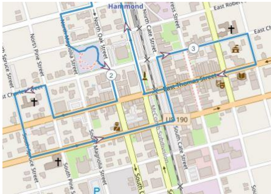
Hammonds - 6K