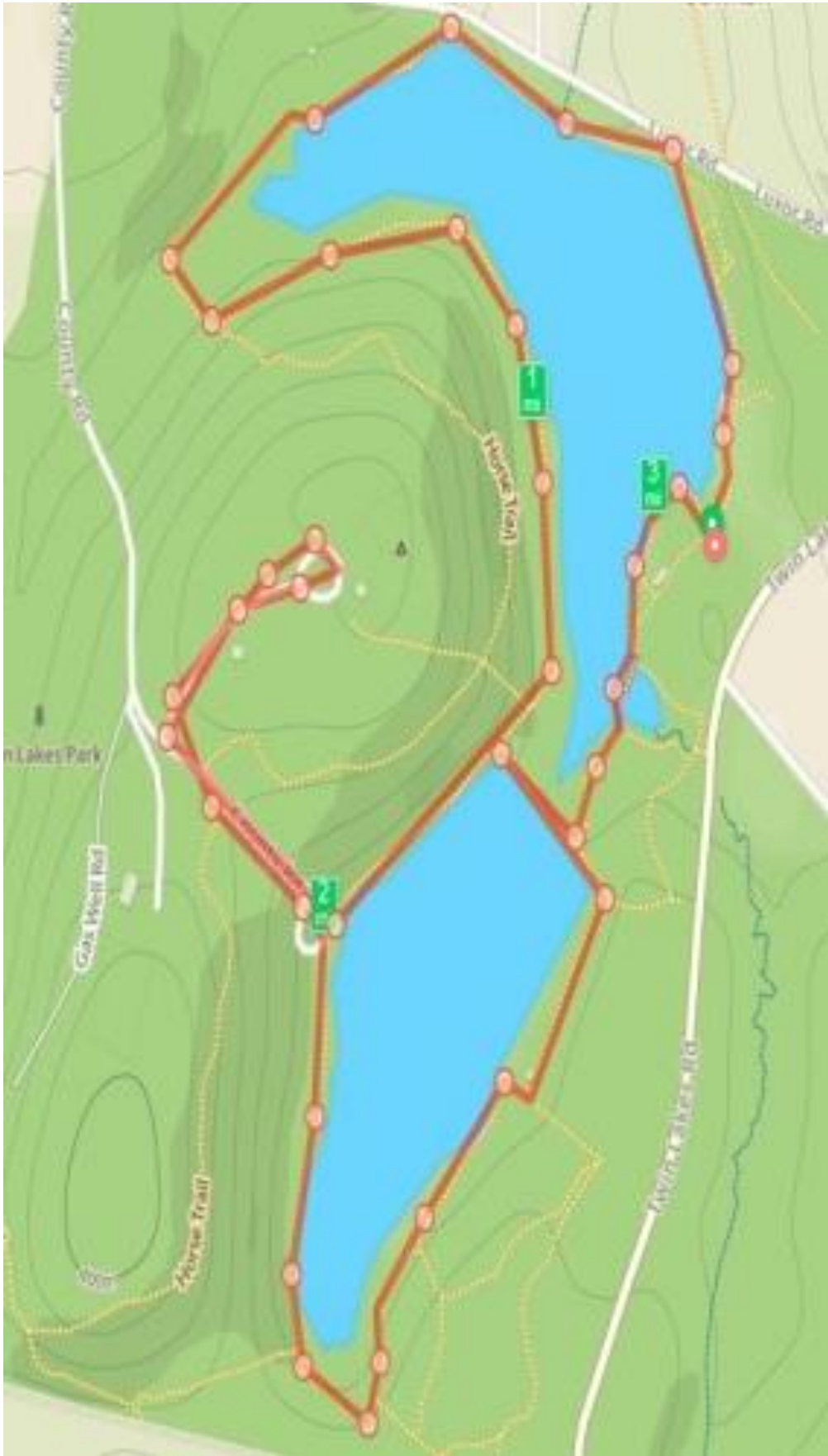
Map of Twin Lakes 5K Walk