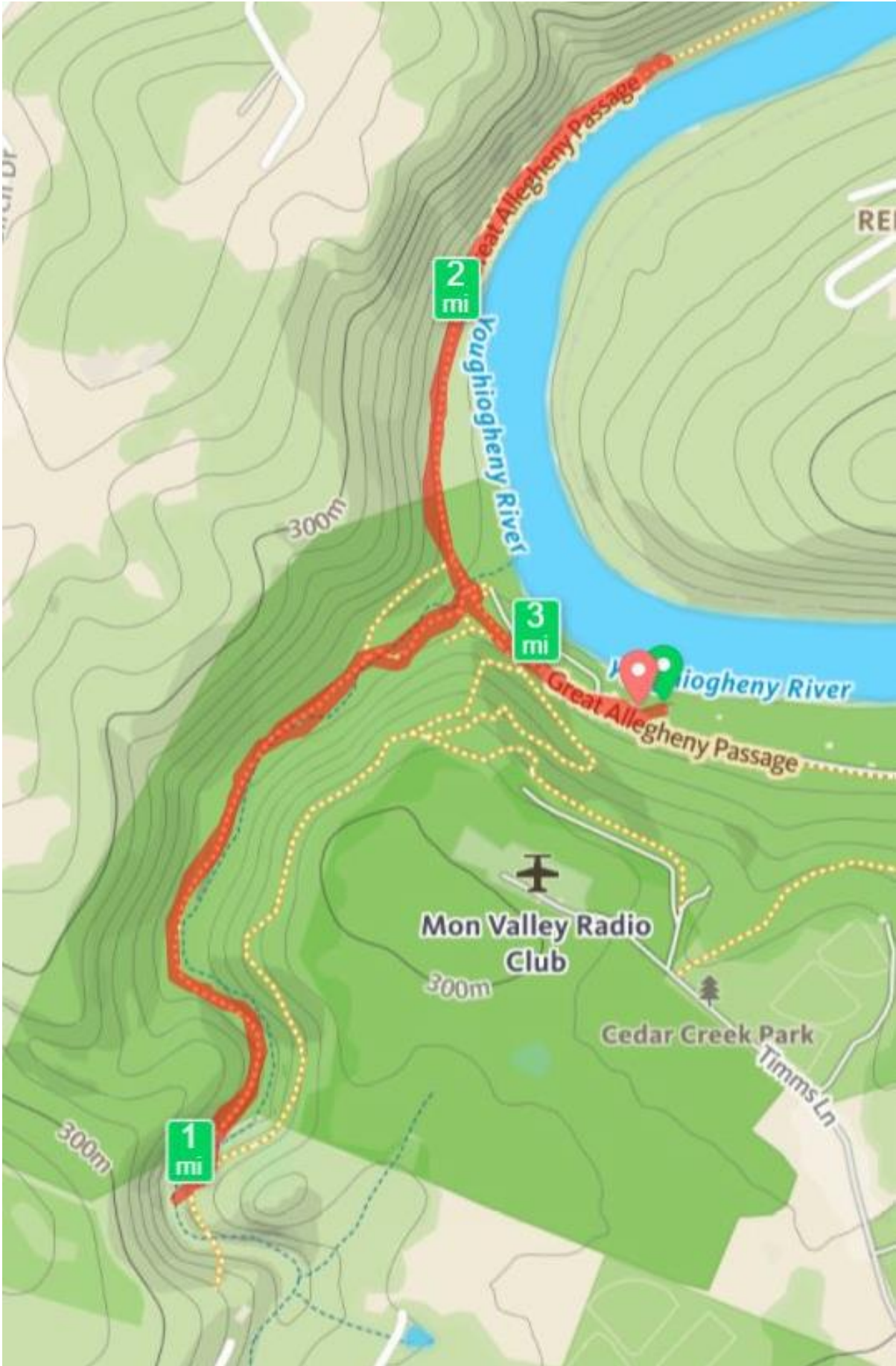
Map of Cedar Creek East 5K Trail