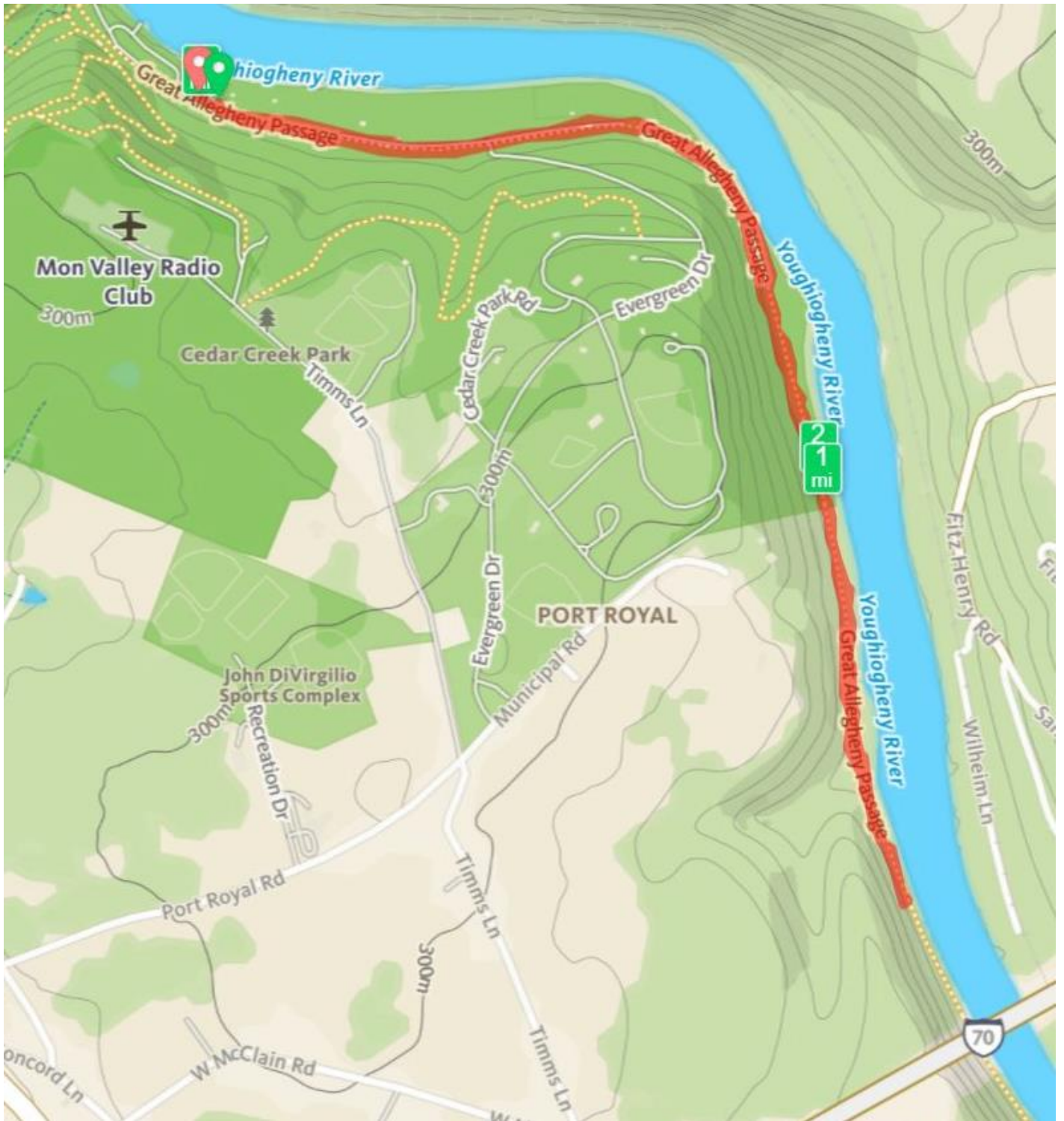
Map of Cedar Creek West 5K Trail