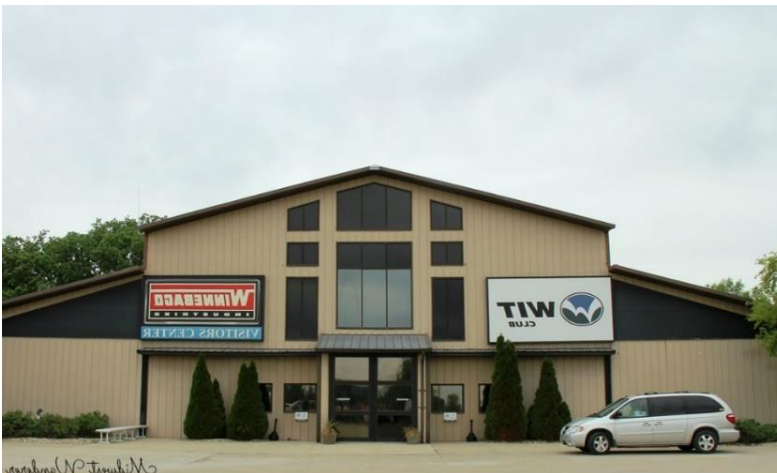
Winnebago Visitor Center

Special Programs: Rockin' Around the Clock, Walking with America's Veterans, and Town Halls/City Halls