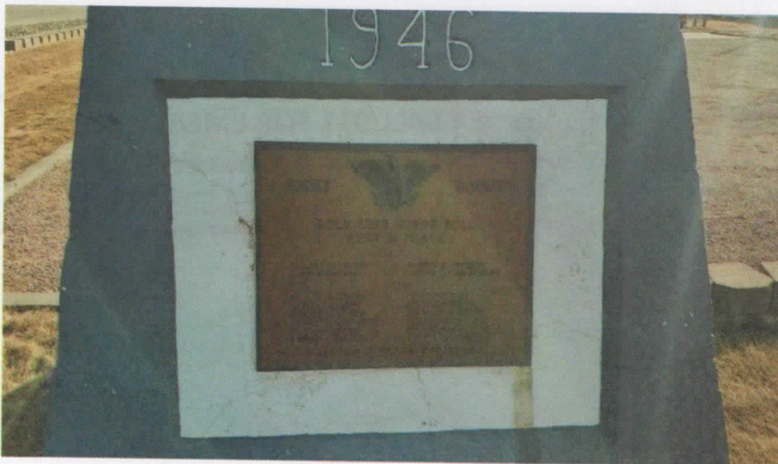
Gold Star Honor Roll