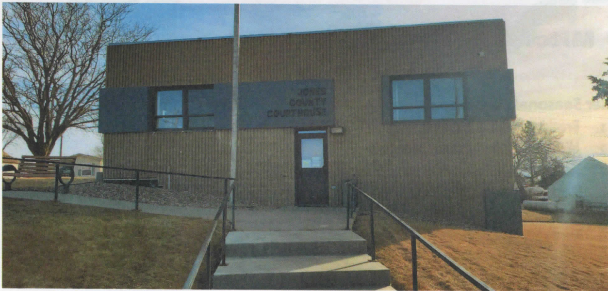
Jones County Court House

Jones County is a county in the U.S. state of South Dakota . As of the 2020 census , the population was 917, [1] making it the least populous county in South Dakota. Its county seat is Murdo . [2] Created in 1916 and organized in 1917, it is the most recently established county in South Dakota. [3]