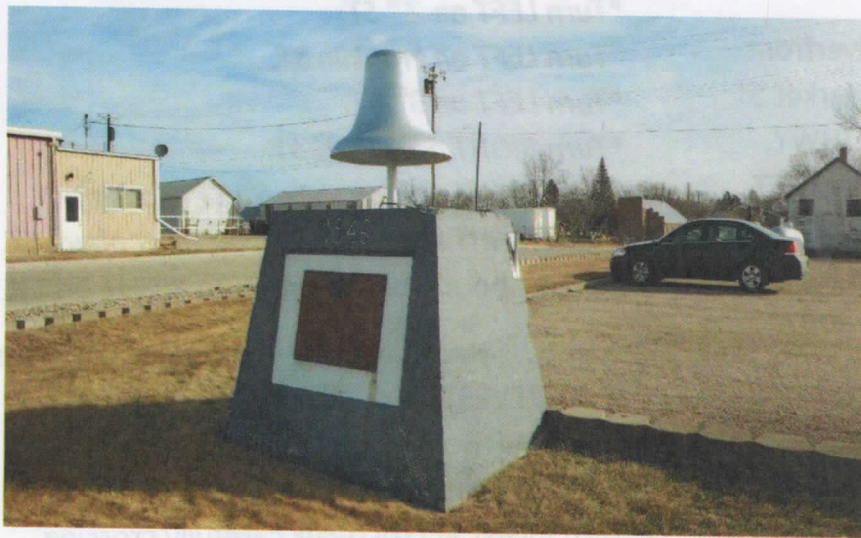
Bell Veterans Memorial