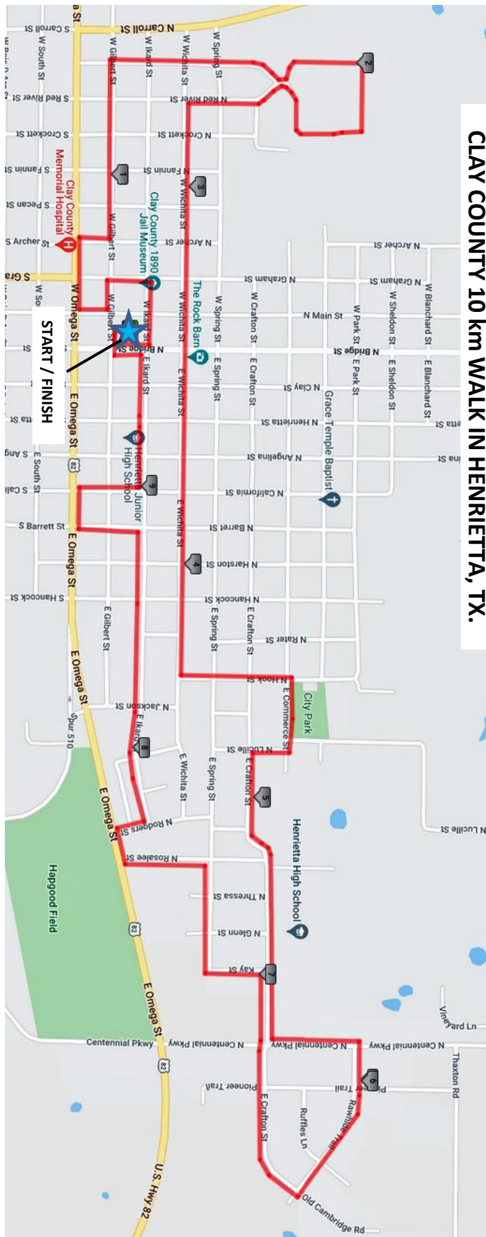
Map data by Google; plotting tools by MAPMYWALK.