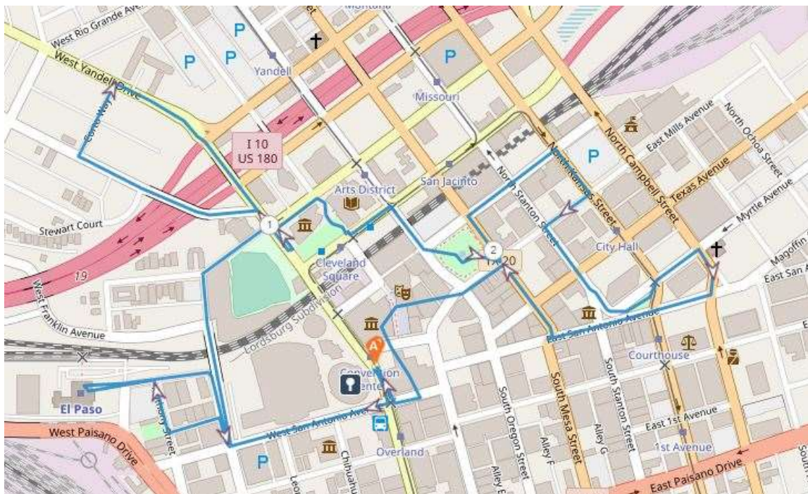
El Paso – 5K