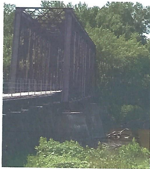
Railroad bridge converted for bikes and pedestrians

Special Programs: Rails to Trails Par for the Course