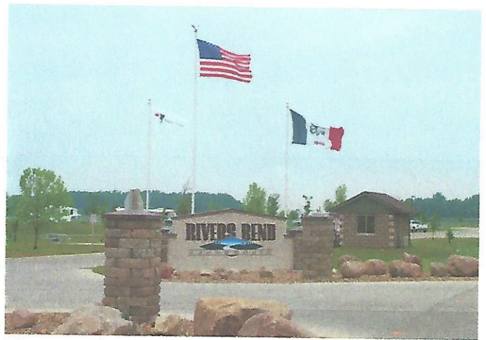
Rivers Bend Campground