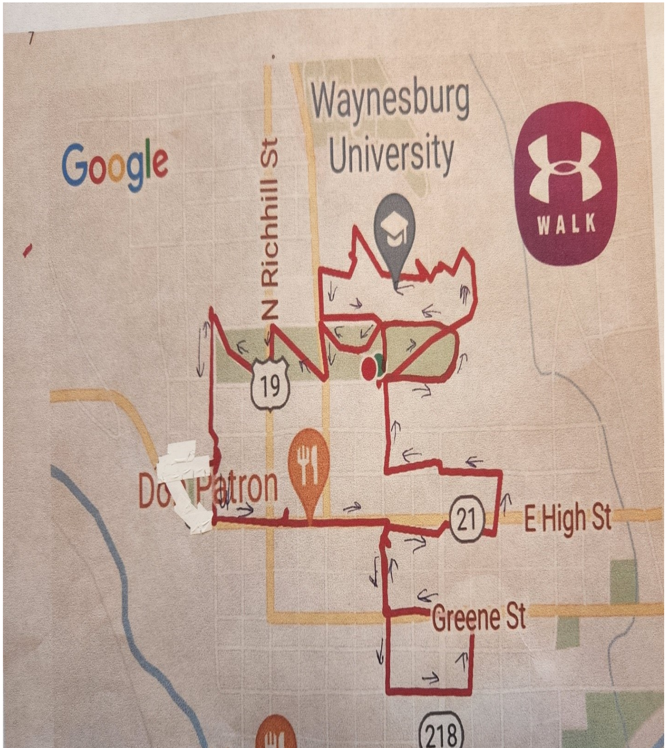
Waynesburg 5K Map