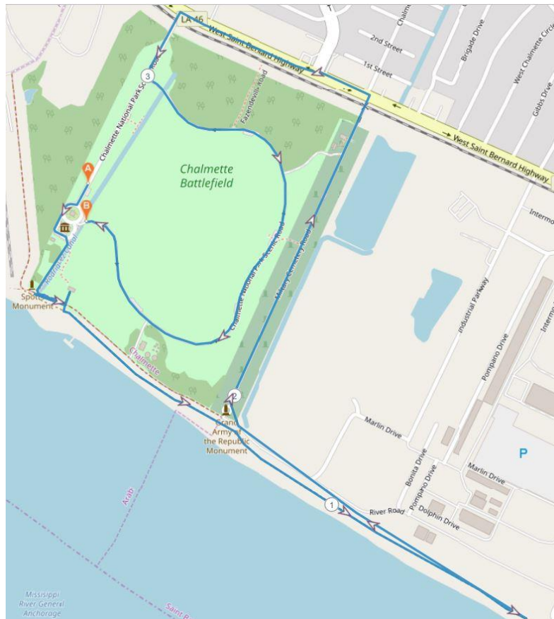
Chalmette – 6k

These walk directions and maps may only be used in conjunction with a signed American Volkssport Association athletic waiver. All other uses are prohibited.