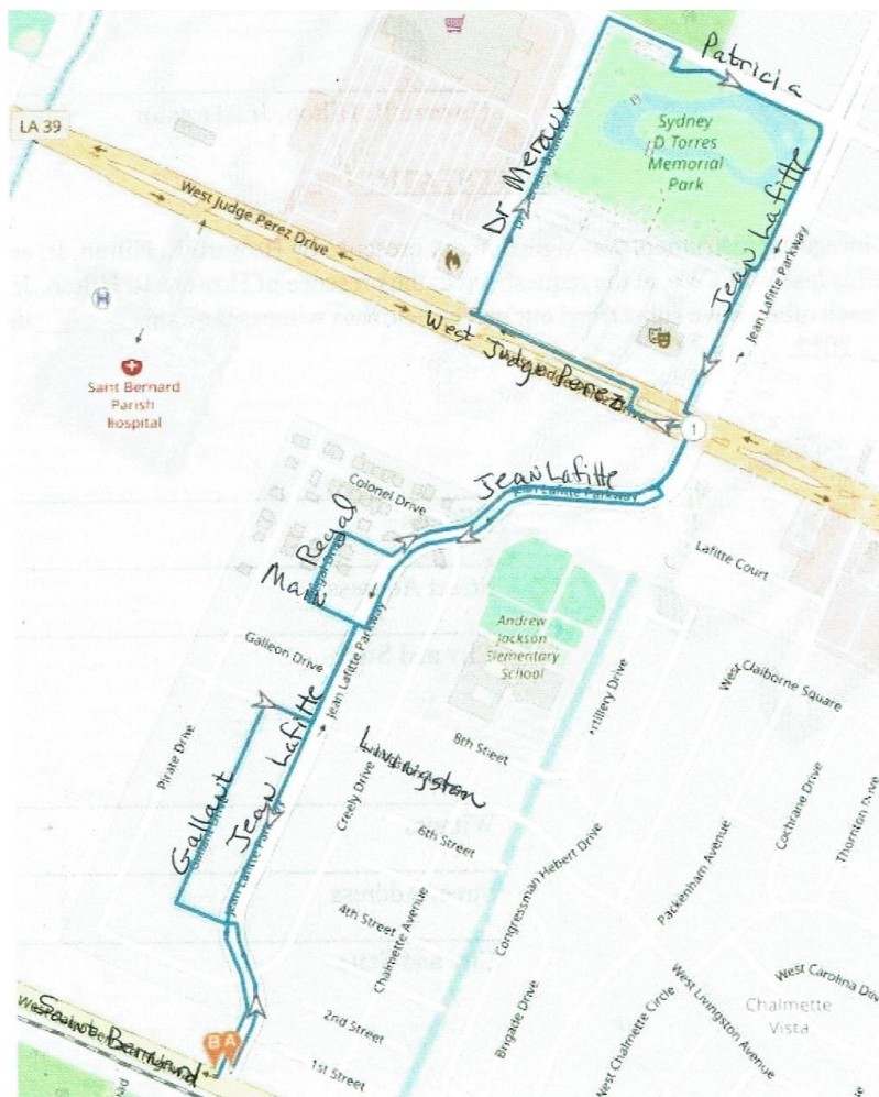
Chalmette – 10k extension