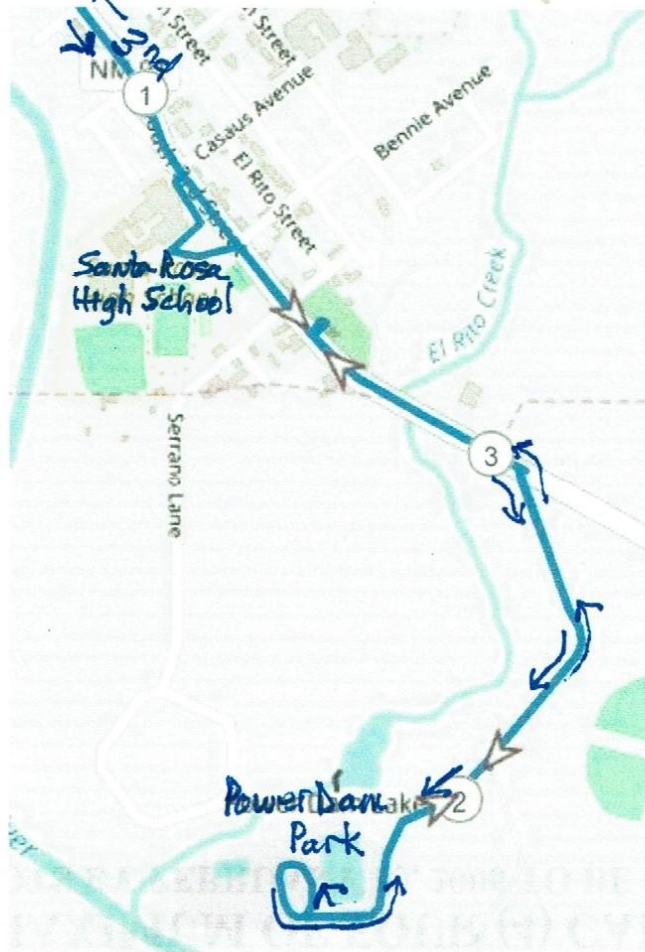
Santa Rosa – 10k extension