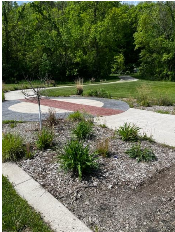
Trailhead to Hoover Nature Trail