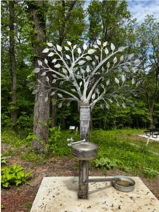
Park Drinking Fountain