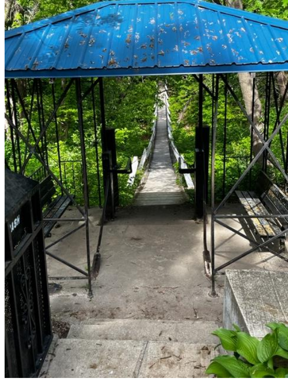
Entrance to the Historic Swinging Bridge