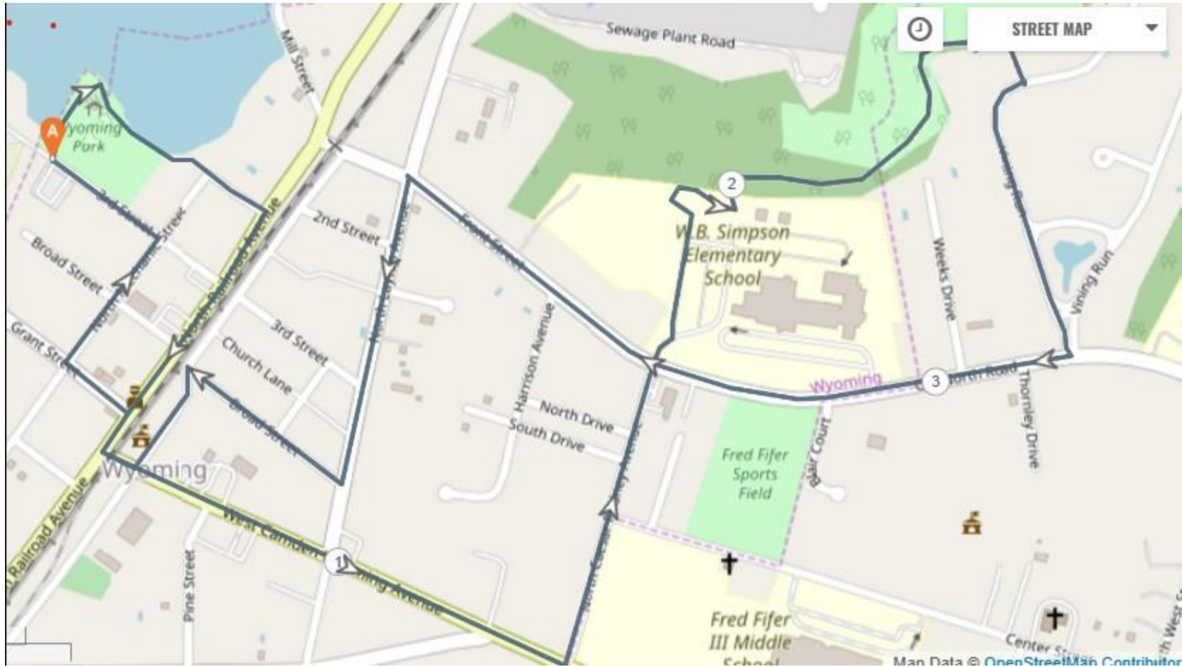
Louise Walk 5K Map