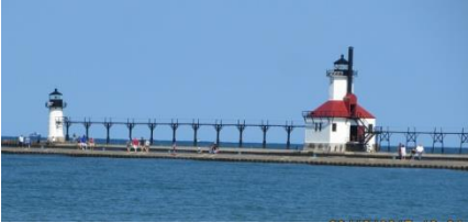
North Pier Lighthouses

April 1 st through September 30 th , 2025