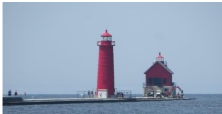
Grand Haven Lighthouses

The trail is on paved roads and sidewalks. It will start in historic downtown Holland, then continue through Kollen Park and along Heinz Waterfront Walkway. It continues through residential neighborhoods and through the beautiful Hope College campus. The walk finishes up with a view of the famous De Zwaan Windmill. The trail is rated 1A.