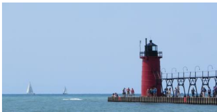
South Pier Lighthouse

The trail is on paved roads and sidewalks. It goes through historic neighborhoods, along the shore of Lake Michigan and historic Silver Beach, past the Saint Joseph North Pier Lighthouses, and through the charming downtown area. The trail is rated 2A.