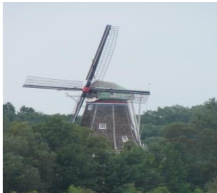
De Zwaan Windmill

The trail is on paved roads and sidewalks. It takes you along the shores of Lake Michigan, past marinas, museums, and quaint shops, through historic neighborhoods, and past the South Haven South Pier Lighthouse. The trail is rated 2A.