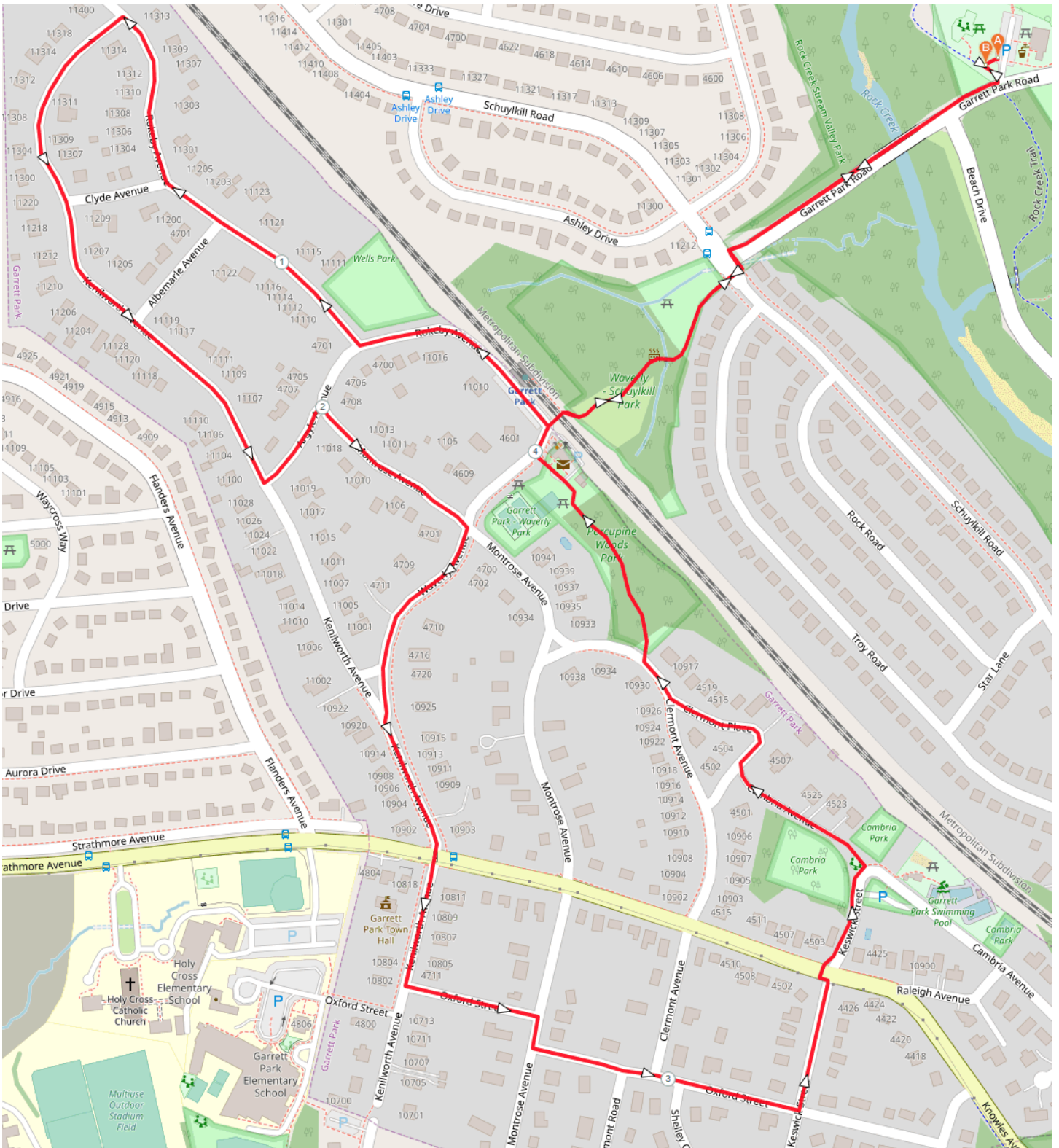
5k map created using plotaroute.com, map data by OpenStreetMap Contributors