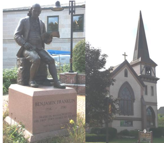
Above Left: Benjamin Franklin Statue outside the Franklin Public Library

AWARD: This is a credit only event. "B" Awards from prior events will be available for $4.00, including IVV Credit.