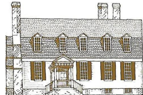
Williamsburg 2020 Day Award