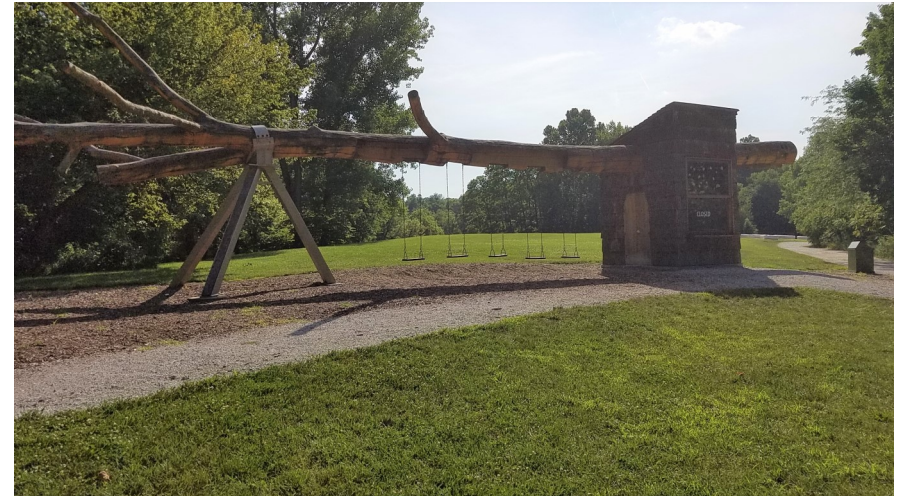
Chop Stick sculpture, IMA 100 Acres Indianapolis, IN

PRESENT A TRAVELING GUIDED WALK VIRGINIA B. FAIRBANKS ART & NATURE PARK (100 ACRES) 1850 W 38TH STREET INDIANAPOLIS, IN 46208