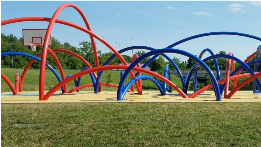
Free Basket sculpture, IMA 100 Acres, Indianapolis, IN

PRESENT A TRAVELING GUIDED WALK VIRGINIA B. FAIRBANKS ART & NATURE PARK (100 ACRES) 1850 W 38TH STREET INDIANAPOLIS, IN 46208