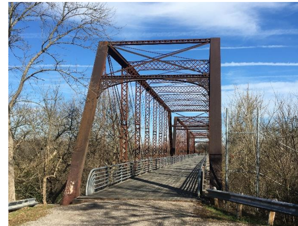
Moore's Crossing Bridge

10k/6k Walk Event ID: SW20/116360 AVA - 77, TVA - 24