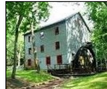
Shoaff's Grist Mill