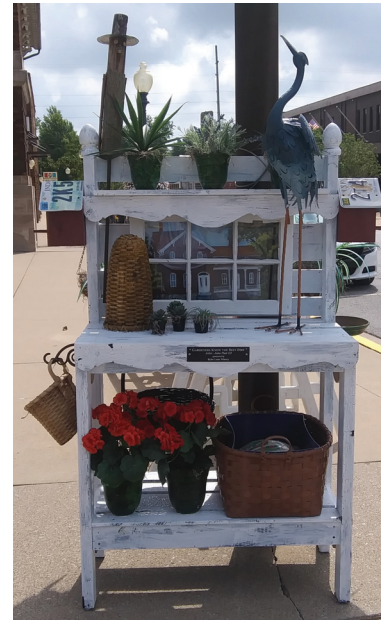
Display of painted workbenches in the downtown area