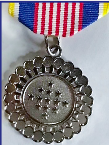
The Freedom Walk Award

The Freedom Walk Award is a certificate signed by officials from the IML and AVA.