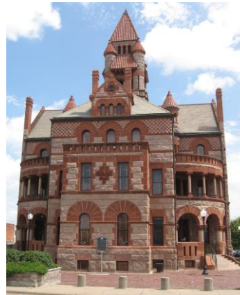
Sulphur Springs (Hopkins Co)