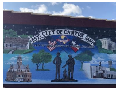
Canton (Van Zandt County) First Monday Market Days