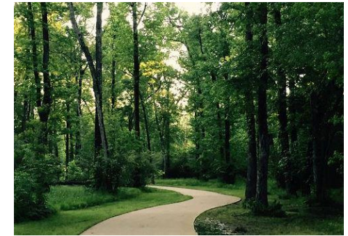
Boorman Trail Longview (Gregg County)