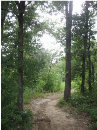
Cooper Lake SP (Delta Co) Doctor's Creek