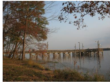
Lake Bob Sandlin State Park (Titus Co)

The following YREs are available in Northeast Texas for 2022 only and are sponsored by the Texas Wanderers. They are available via the Online Start Box. However the POC will have copies of the directions and the stamps available during the New Year's weekend events.