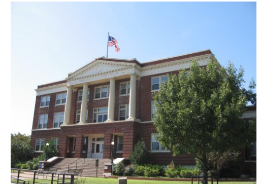
Quitman (Wood County)