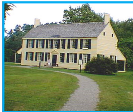
Philip Schuyler House

(Sarachtogoe - Iroquois for (old) Saratoga)