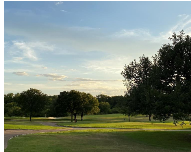
Onion Creek Club Golf Course

10Km/6Km Walk – “B” Awards Event ID: SW22 / 123845 AVA – 77, TVA -24