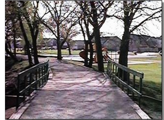
Elm Creek Park