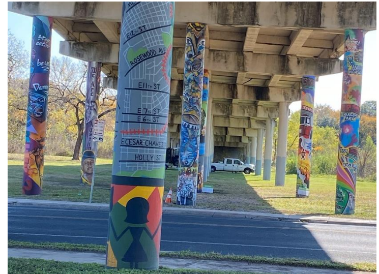
The Pillars Project