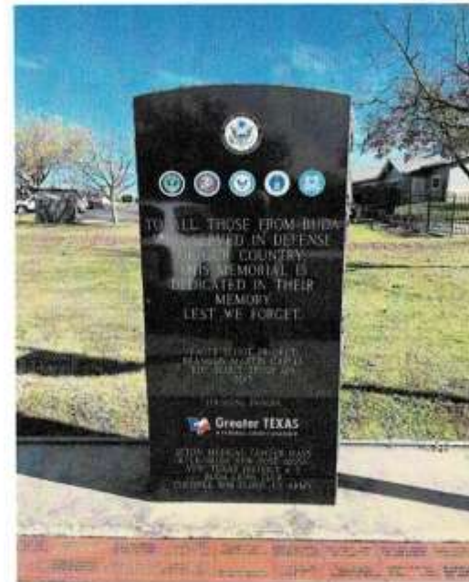
Veterans Memorial near start point.

10Km/6Km Walk - "B" Awards Event ID: 126733 AVA-77