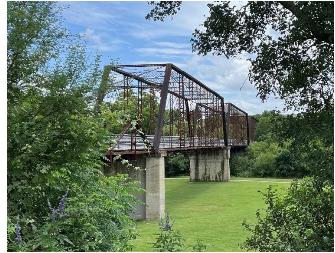
Moore's Crossing Bridge

10k/5k Walk Event ID: SW24/127313 AVA – 77, TVA -24