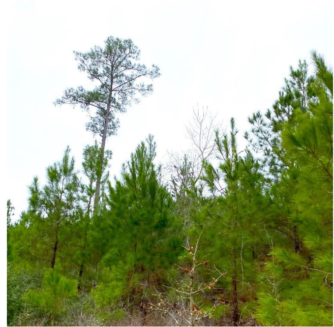
Loblolly Pine Regrowth, Bastrop State Park