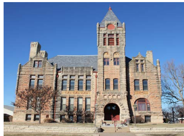
Old Arkansas City High School

Arkansas City was founded by white settlers in 1870 and grew rapidly with the expansion of the AT&SF railroad. During the 1880s the downtown commercial district grew rapidly with the building of several brick-and-stone buildings on Summit Street which are still present today. The town continued to grow with the discovery of oil in Cowley County, & the building of a refinery. In the early years of the 20th century, flour mills were built and the meat packing industry grew. Strother Field, located between Ark City and Winfield, & jointly operated, was a training base during WWII. Near the beginning of the 21st century, the community suffered economic losses with the closing of Morrell Meats and Total Oil Refinery. Today, Arkansas City still remains an economic hub for government, finance, and specialty retail shops. The community leaders are presently taking on the challenge of reviving businesses along Summit Street and the renovation of the historic downtown buildings.