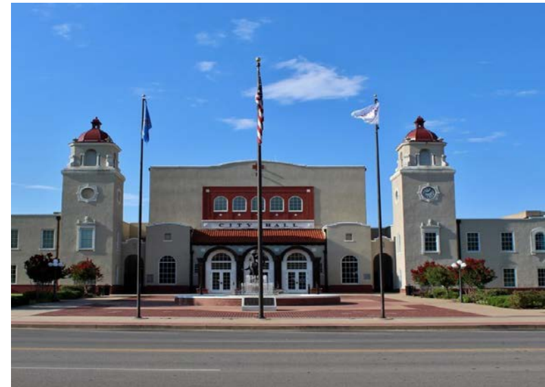
Ponca City City Hall

DISCLAIMER: Sponsors of these events are not liable for accidents, thefts, and/or material damage. Every effort will be made to keep these events safe, enjoyable and memorable.