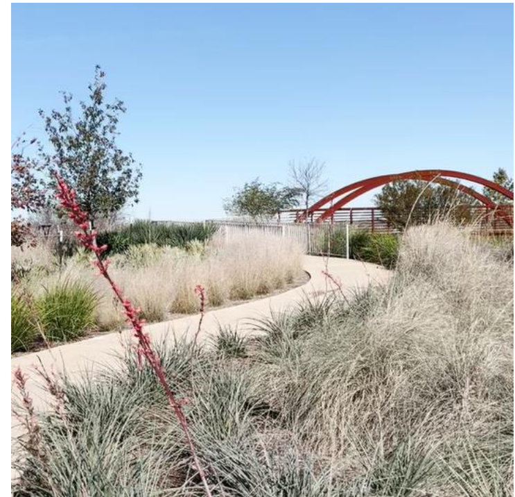
Skyline Park at Easton Park