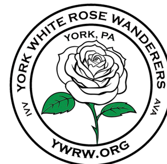
"A" Award is a 1" Hat Pin and a 3" Sticker