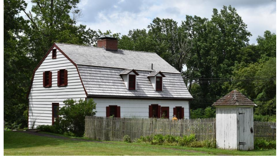
Johnson Ferry House New Jersey State Park National Historic Landmark

Special Event Programs: Border Crossings Walking the United States Walking the USA A-Z Rails to Trails