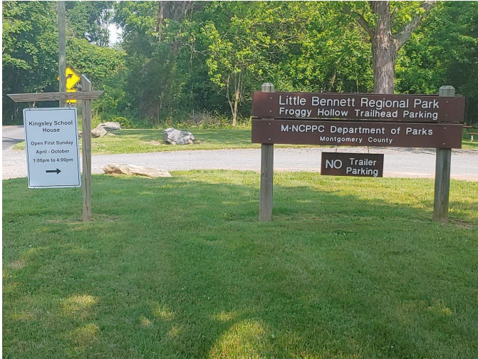
Trailhead Parking Area (5K and 10K).