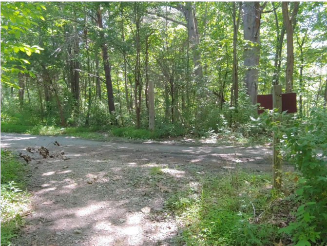
Intersection of Purdum Trail and gravel road. Turn LEFT (10K).