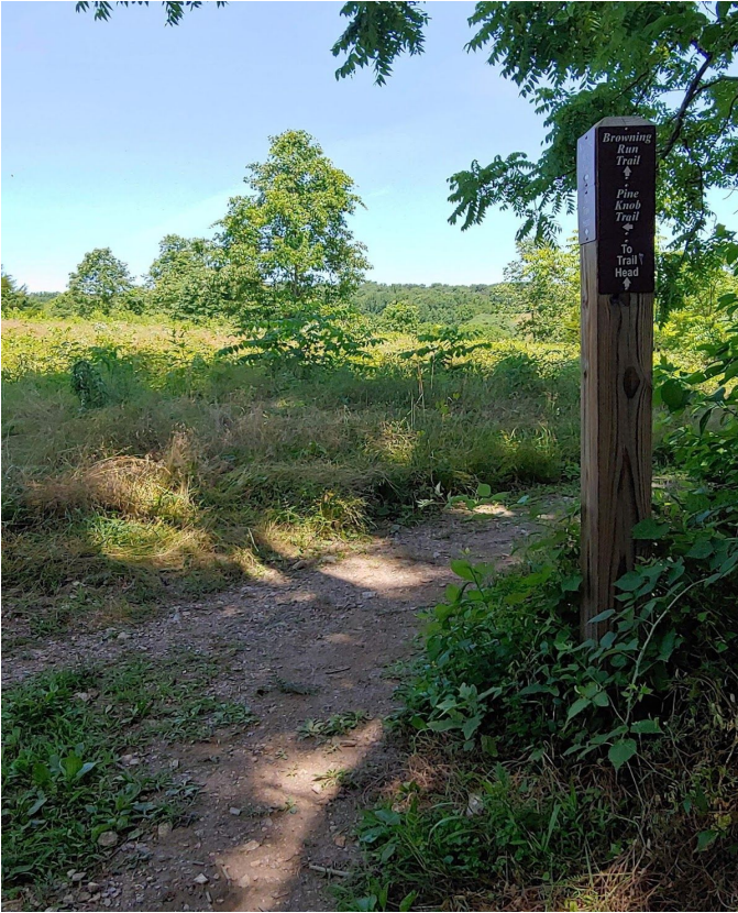
Browning Run Trail Post (10K).