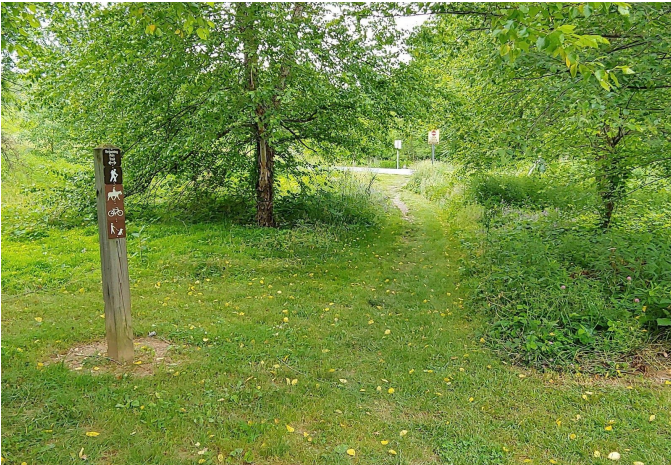
Browning Run Trail crossing of Clarksburg Rd (10K).