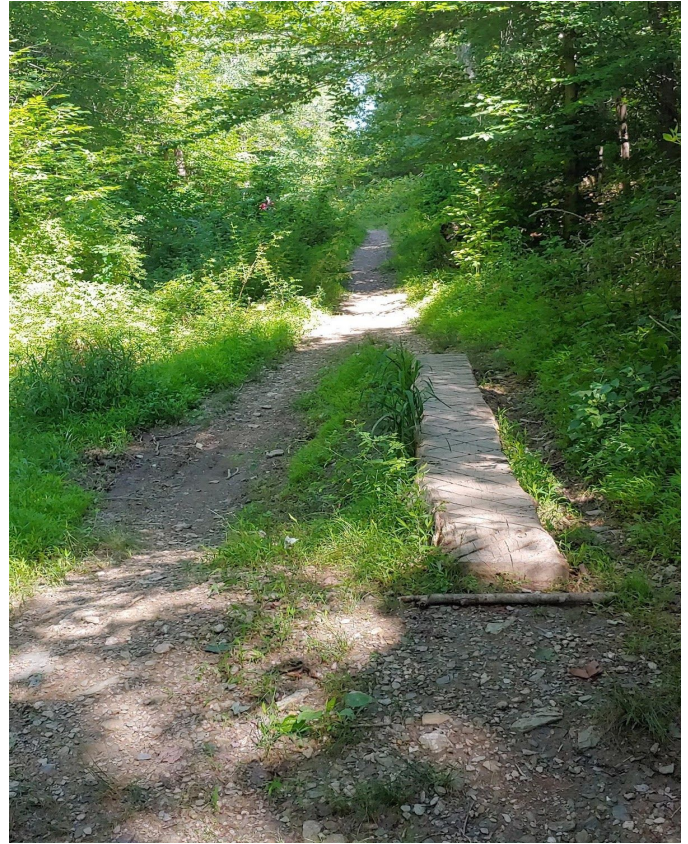
Log bridge (5K).