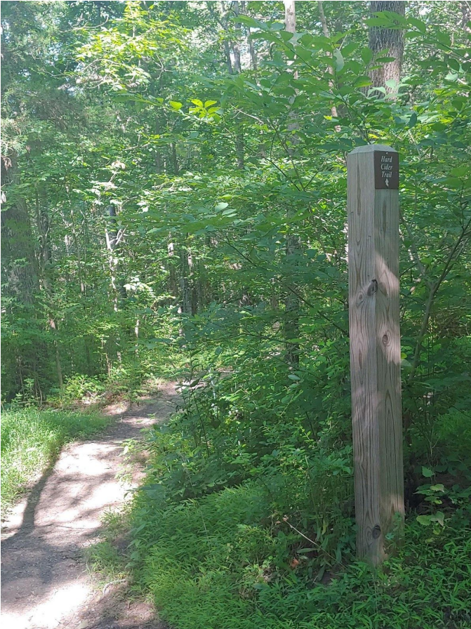
Hard Cider Trail Intersection with Purdum Trail (5K and 10K).