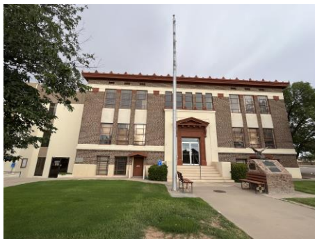
LORDSBURG - HILDALGO CO