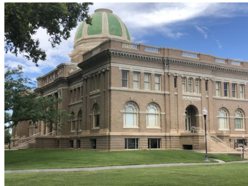
ROSWELL - CHAVES COUNTY