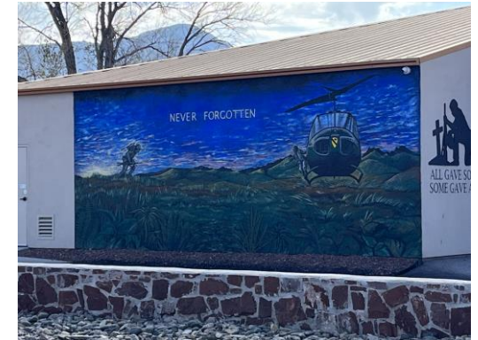
TRUTH OR CONSEQUENCES SIERRA COUNTY