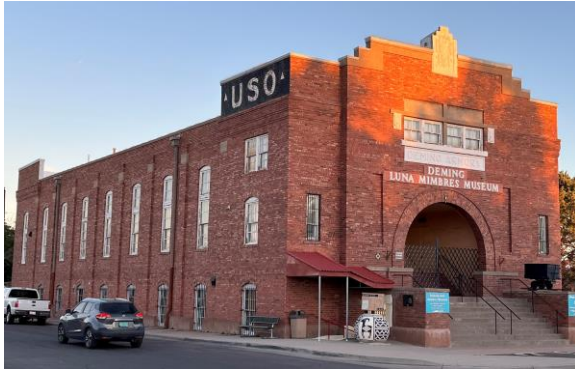
DEMING - LUNA COUNTY