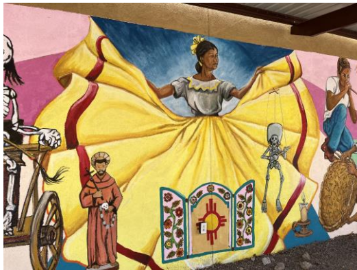
SILVER CITY - GRANT COUNTY