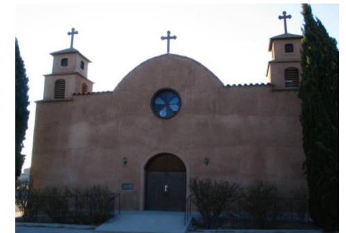
SAN ANTONIO - SOCORRO COUNTY