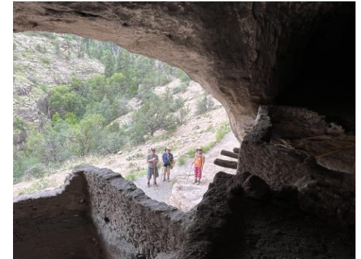
GILA CLIFFS NATIONAL MONUMENT - CATRON COUNTY