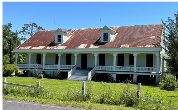
LaPLACE ST JOHN THE BAPTIST PARISH