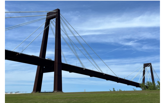
LULING ST CHARLES PARISH