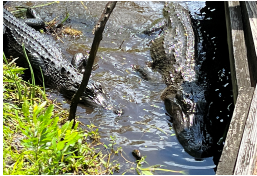
BARATARIA NATURE PRESERVE JEFFERSON PARISH