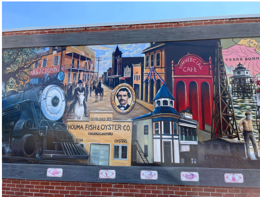
HOUMA - TERREBONNE PARISH