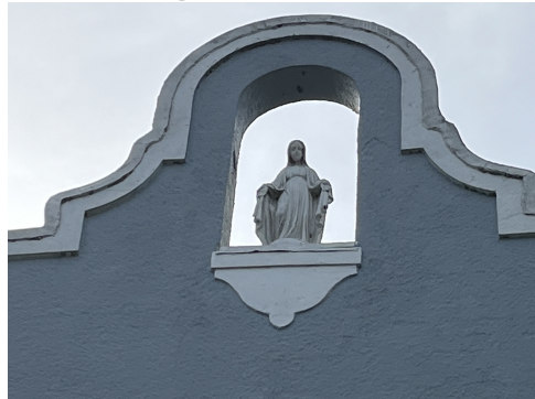
BELLE CHASSE PLAQUEMINES PARISH