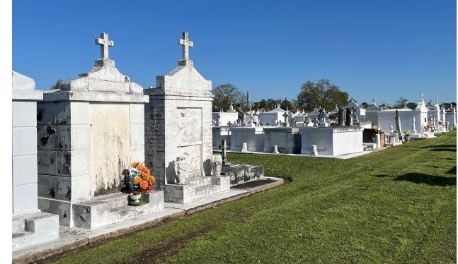
THIBODAUX LAFORCE PARISH