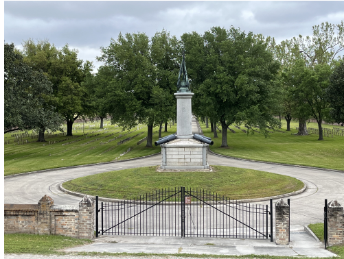
CHALMETTE ST BERNARD PARISH