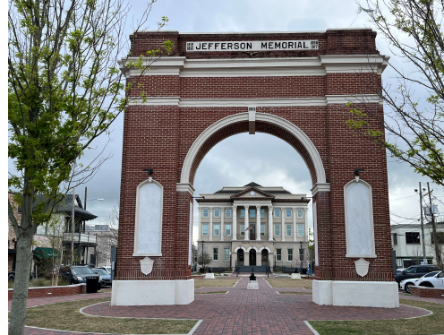
GREटना JEFFERSON PARISH