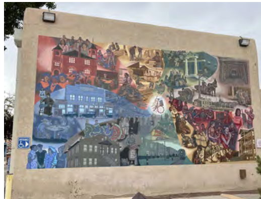
GALLUP – 5K