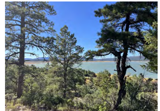
HERON LAKE STATE PARK