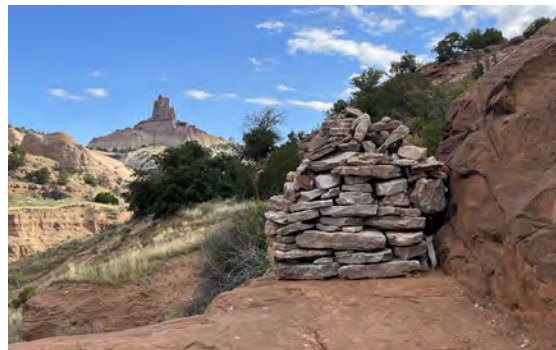
RED ROCK CHURCH ROCK – 5K