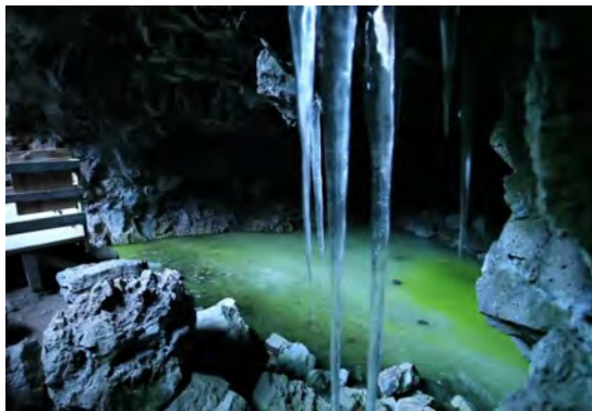
ICE CAVE – 2K