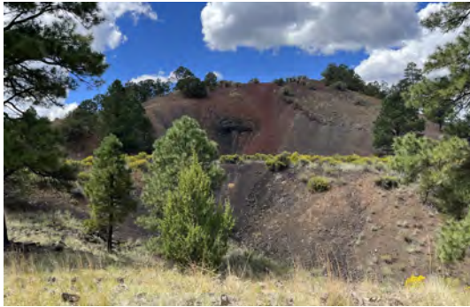
EL CALDERON TRAIL – 6K