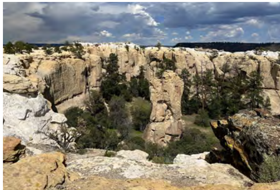
EL MORRO – 3K