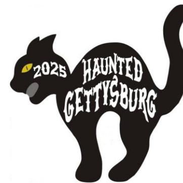
"A" Award is a 1" Hat Pin and a 3" Sticker